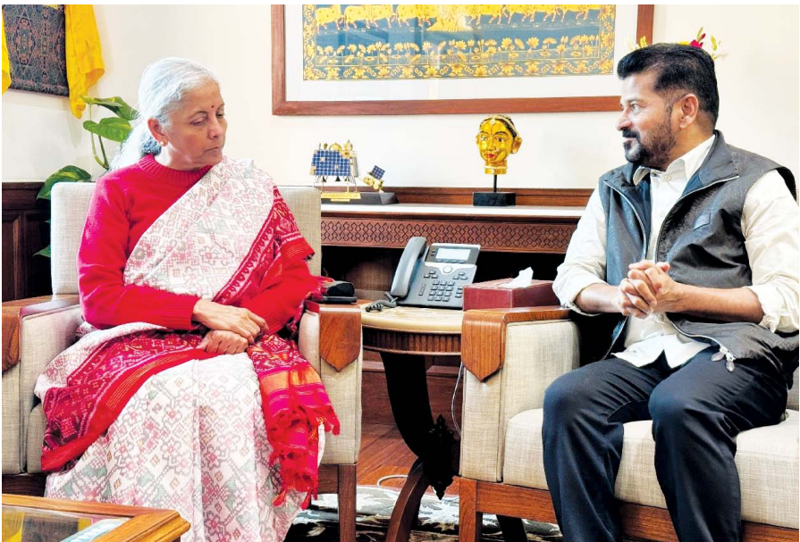
CM Revanth Reddy sought Union support and FRBM exemption for the ₹30,000 crore Young India Integrated d Residential Schools project and pressed for an IIM, Kendriya Vidyalayas, and Navodaya Vidyalayas in Telangana.

HYDERABAD (TSIT) : Chief Minister A. Revanth Reddy on Tuesday met Union Finance and Corporate Affairs Minister Nirmala Sitharaman in New Delhi and urged her to extend support for the establishment of Young India Integrated Residential Schools (YIIRS). The Chief Minister informed the Union Minister that the State government plans to set up 105 YIIRS across Telangana. According to the Chief Minister's Office (CMO), he highlighted that through the YIIRS, quality education would be provided directly and indirectly to nearly four lakh students. The Chief Minister also stated that the construction of the YIIRS and other educational institutions would involve an expenditure of Rs 30,000 crore. He requested the Union Finance Minister to exempt the loans raised for this purpose from the Fiscal Responsibility and Budget Management (FRBM) limits, considering the large-scale investment in education infrastructure.