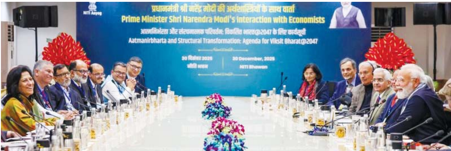
Prime Minister Narendra Modi during a pre-Budget meeting with eminent economists and sectoral experts at NITI Aayog, in New Delhi....

The Chief Minister said zonal commissioners must respond promptly to public grievances received through toll-free numbers and prepare five-year action plans for their zones. He concluded that coordinated efforts by all departments were essential to securing a better future for the city.