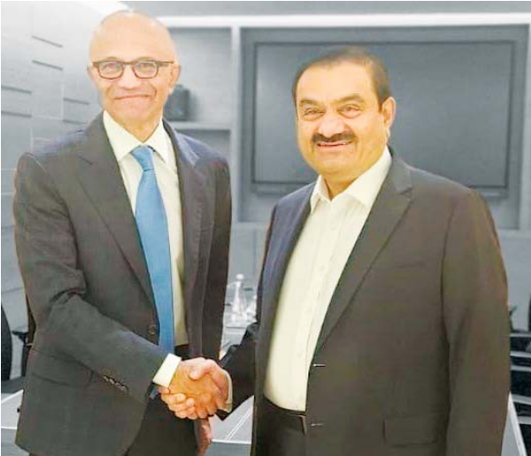
power of AI for a better planet". "Thank you, Prime Minister Narendra Modi, for an

excited to continue building a 360 degree partnership as the physical and digital worlds converge in the age of AI,” said the Adani Group Chairman in an X post. Gautam Adani further said that “Getting a demo from him of the AI apps he is personally building was another testament to the hands-on leadership that truly great leaders exemplify”. Nadella on Tuesday met Prime Minister Narendra Modi, who asserted that the country's youth "will harness this opportunity to innovate and leverage the