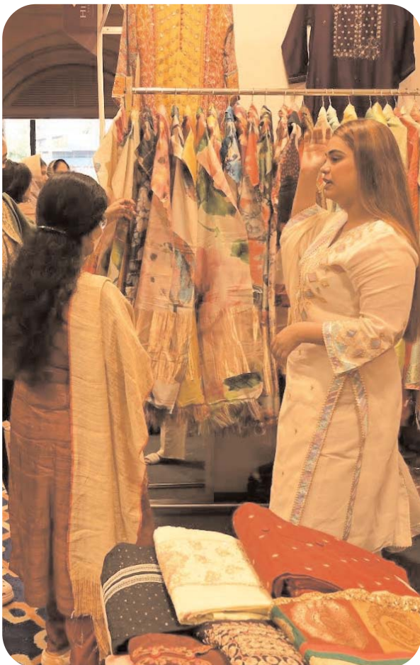
Hyderabad, closes the year with unmatched glamour at the year-end edition of Hi Life Exhibition. Discover designer fashion, couture wear, jewellery, festive collections, lifestyle décor, and statement accessories — all crafted to elevate your year-end celebrations. Join us on 27th, 28th & 29th December at Novotel HICC, and experience fashion, luxury, and creativity come alive.

Market Operations) purchase and swap auctions will be conducted between December 29, 2025 and January 22, 2026. Announcing the decision, the Reserve Bank of India (RBI) said it will continue to monitor evolving liquidity and market conditions and take measures as appropriate to ensure orderly liquidity conditions. The latest announcement comes days after the RBI conducted Rs 1 lakh crore OMO purchase auctions of Government of India securities and USD/INR Buy/Sell Swap auction of USD 5 billion for a tenor of three years. Foreign Institutional Investors (FIIs) offloaded equities worth Rs 1,794.80 crore on Tuesday, according to exchange data.