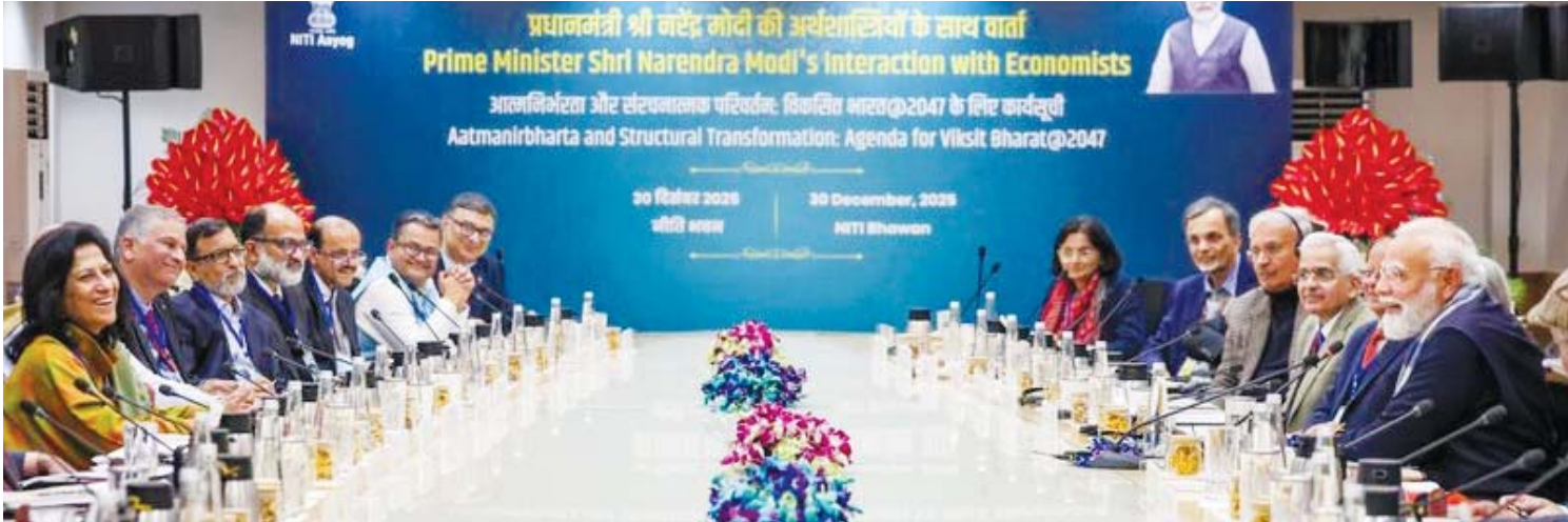
Prime Minister Narendra Modi during a pre-Budget meeting with eminent economists and sectoral experts at NITI Aayog, in New Delhi....

The Chief Minister said zonal commissioners must respond promptly to public grievances received through toll-free numbers and prepare five-year action plans for their zones. He concluded that coordinated efforts by all departments were essential to securing a better future for the city.