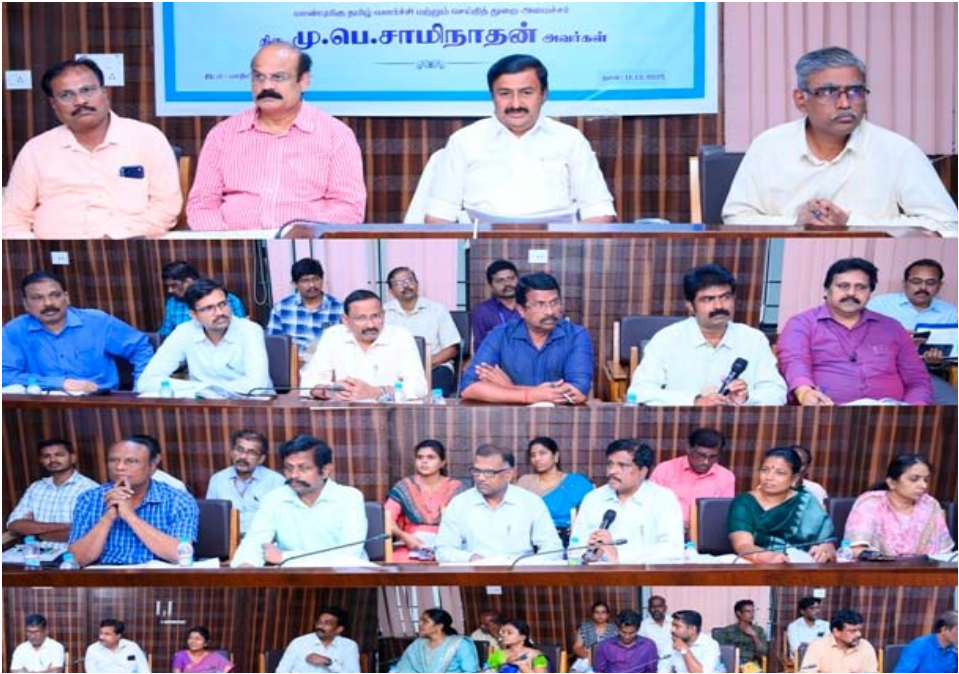
Minister for Tamil Development, Information and Publicity chaired the review meeting for Regional Joint Directors of the Information and Public Relations Department at the State Information Centre Conference Hall in the Kalaivanar Arangam Complex, Chennai.