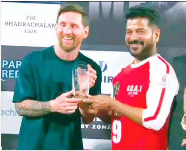
Messi mania grips Hyderabad as Rahul Gandhi arrives for football event

The friendly match was played between the Singareni RR and Aparna teams, with Chief Minister Revanth Reddy representing Singareni RR and Lionel Messi turning out for the Aparna team. The match drew huge cheers