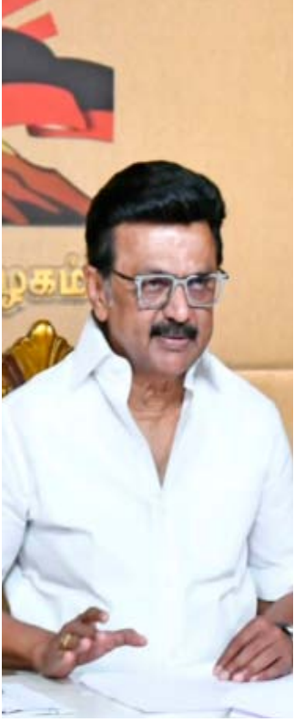
lakh crore, taking the total value of the economy to Rs 31.19 lakh crore.

CHENNAI: Chief Minister M.K. Stalin on Saturday asserted that Tamil Nadu would emerge as the number one State in India across all spheres by 2031, when what he described as “Dravidian Model 2.0” reaches completion. In a post on social media platform X, he highlighted Tamil Nadu’s current economic performance, saying the State had topped the country in Gross State Domestic Product growth with a rate of 16 per cent. He said the achievement was notable as Tamil Nadu was neither among the largest States by area nor by population, and did not receive extensive support from the Union government. Stalin said Tamil Nadu had recorded stable and high growth over the past three years, a trend reflected in data released by the Reserve Bank of India. Between the financial years 2021 and 2025, the State’s economy had expanded by about Rs 10.5