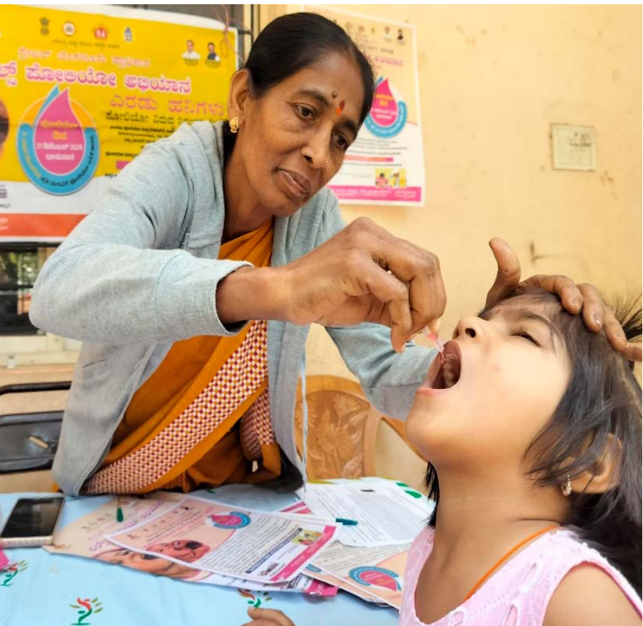
UNDER THE NATIONAL PULSE POLIO MISSION PULSE POLIO DROPS GIVEN TO CHILDREN IN ANJANAGAR GOVERNMENT SCHOOL SANATANAYA.