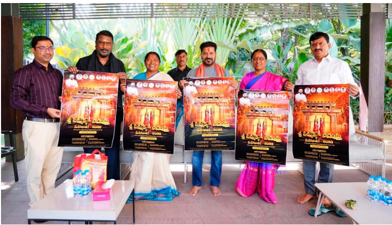
Hyderabad: Telangana Chief Minister Revanth Reddy on Sunday unveiled the poster of Medaram Maha Jatara-2026 at