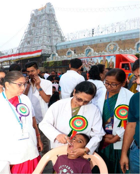
PULS POLIO PROGRAM IN TIRUMALA.