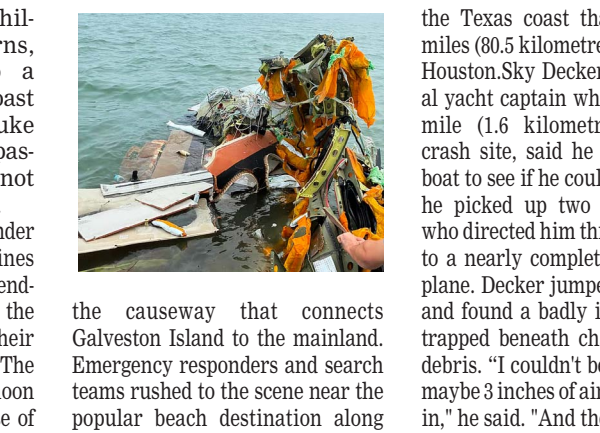
the causeway that connects Galveston Island to the mainland. Emergency responders and search teams rushed to the scene near the popular beach destination along