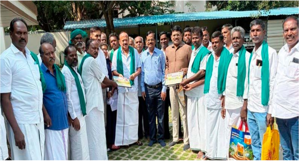
On the occasion of National Farmers Day, representatives of farmers associations and farmers called on the Honble Minister for Agriculture and Farmers Welfare and conveyed their greetings

around 20 minutes and is learnt to have also held discussions with other BJP leaders. Addressing reporters later, OPS said the meeting with Amit Shah was a courtesy call and that the discussion focused on the prevailing political situation in Tamil Nadu. However, political circles suggest that the BJP is keen on bringing OPS back into the NDA. According to sources, OPS has placed a firm condition for any return - reunification of the All India Anna Dravida Munnetra Kazhagam (AIADMK). Sources said OPS clearly conveyed to Amit Shah that he would not rejoin the NDA until the AIADMK merger process is completed. As anticipation builds ahead of the meeting in Chennai, observers believe the decisions emerging from the district secretaries' meet could shape the political course of OPS in the run-up to the elections.