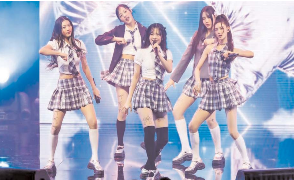
Chart-topping K-pop band NewJeans' record label, Ador, is suing one of the band's members in what is yet another twist in their bitter year-long feud. Hybe, the record label's parent company, confirmed to the BBC that it is suing Danielle Marsh, one of her family members, and ex-boss Min Hee-jin for $30m (£22m) in damages and as part of a contract break penalty. The band has been plunged into further turmoil as the return of Minji, another of its stars, remains uncertain, leaving the band with three members. Coming less than two months after reports that

NewJeans would return to the label as a band of five, this news dashes fans' hopes of a comeback. Many took to social media with the slogan: "NewJeans is five or nothing, while others questioned why Danielle was singled out. "Does this make any sense??? NewJeans without Danielle isn't NewJeans. Do you think you can just erase a member this easily? Give us back Danielle," one wrote in an X post. "It's not fair at all. Free NewJeans [all 5 members]," another wrote on Instagram. "All they wanted to do was to be [artists] and make their fans happy."