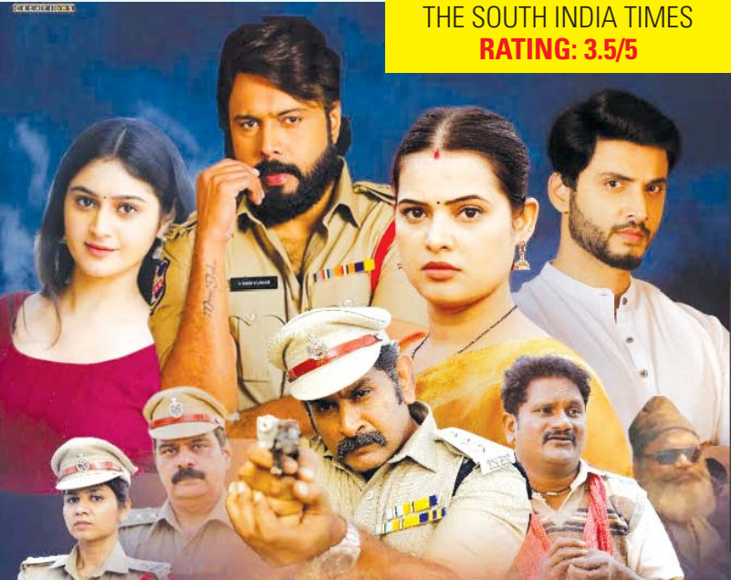
succeeds to a fair extent. The interval block delivers an unexpected twist, pushing the story to the next level. In the second half, the

tantly, who killed SI Ramkhi? These questions unfold through a series of twists, suspenseful turns, and surprises. Analysis While watching Missterious, viewers may be reminded of familiar triangle love stories seen in everyday life. However, the director gives this routine setup a fresh spin by blending it with suspense, thriller elements, and a subtle horror layer. It is evident that the story has been written with care, keeping the genre's demands in mind. Being a suspense thriller, the director avoids unnecessary delays in character introductions and quickly moves into the core plot. Characters are introduced while the story progresses, ensuring that twists arrive at regular intervals. The identity of the killer remains a question mark until the climax, which helps keep the audience engaged. In this aspect, the director