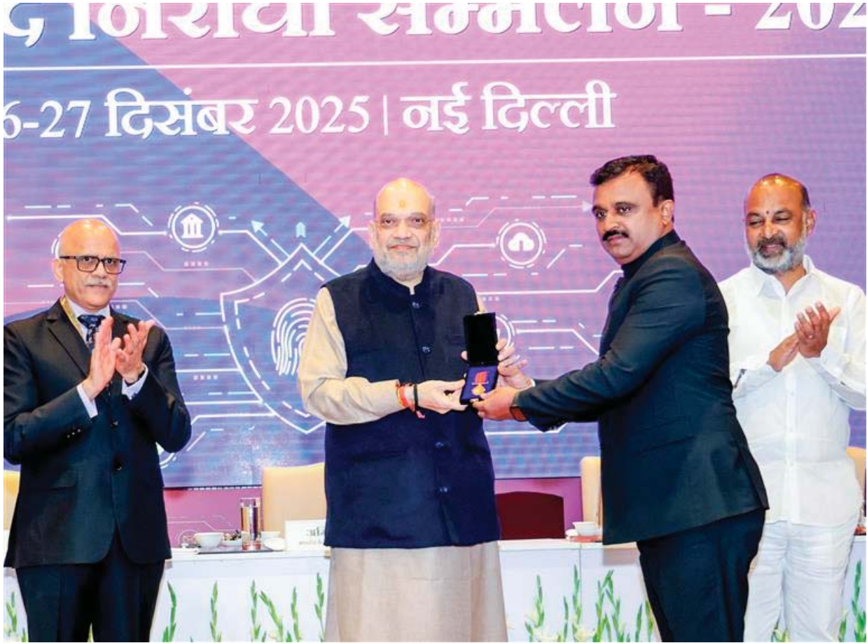
Union Home and Cooperation Minister Amit Shah participating in the inaugural function of 'Anti-Terrorism Conference-2025' in New Delhi on December 26, 2025.

performance in recent Gram Panchayat elections, calling it a sign of strong grassroots support despite political pressure. Announcing protective measures for elected local representatives, KTR said BRS would set up legal cells and training programmes in every district. He emphasised the constitutional authority of Sarpanches and accused the government of misusing power to harass local bodies. He highlighted that the government's retreat on the Lagacharla land issue was a direct result of the party's massive protest in Mahabubabad.