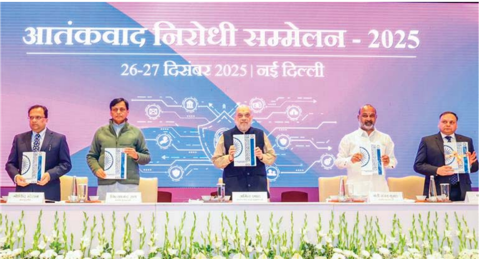
UNION HOME AND COOPERATION MINISTER AMIT SHAH PARTICIPATING IN THE INAUGURAL FUNCTION OF 'ANTI-TERRORISM CONFERENCE-2025' IN NEW DELHI.

On October 6, advocate Rakesh Kishore, now suspended, hurled a shoe towards then CJI Gavai during proceedings. He was apparently miffed over Gavai's alleged remarks on Hindu gods in an earlier proceeding. As the incident sparked widespread condemnation, Modi spoke to the then CJI and said the attack was "reprehensible" and angered every Indian.