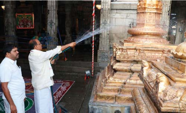
Tirupati, 25 December 2025 Koil Alwar Tirumanjanam was conducted in a grand and traditional manner at the Sri Govindaraja Swamy Temple, Tirupati, on