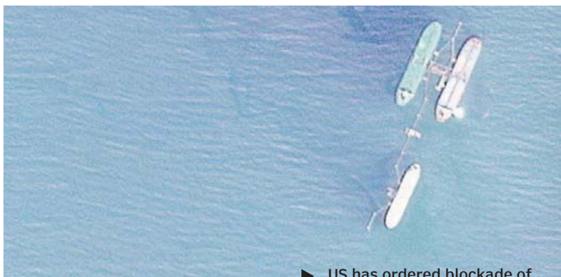
Beijing opposes all forms of unilateral bullying and supports countries in safeguarding their sovereignty and national dignity

China voiced political support for Venezuela Thursday after the United States ordered a blockade of sanctioned oil tankers, denouncing what it called 'unilateral bullying' but offering no details on any concrete assistance to its long-time oil supplier