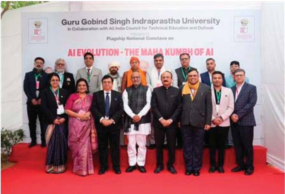
Vice President Shri C. P. Radhakrishnan in a group photo during the National Conference on "AI Evolution" in New Delhi.....

"A Hindu man was brutally assaulted and killed.