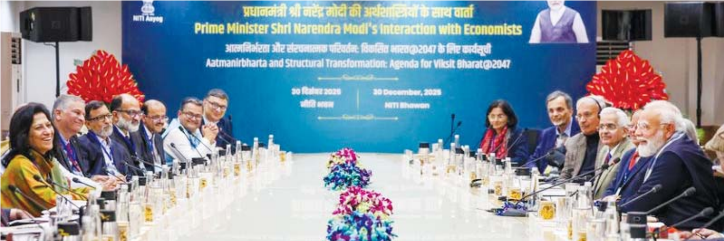
Prime Minister Narendra Modi during a pre-Budget meeting with eminent economists and sectoral experts at NITI Aayog, in New Delhi.....

The Chief Minister said zonal commissioners must respond promptly to public grievances received through toll-free numbers and prepare five-year action plans for their zones. He concluded that coordinated efforts by all departments were essential to securing a better future for the city.