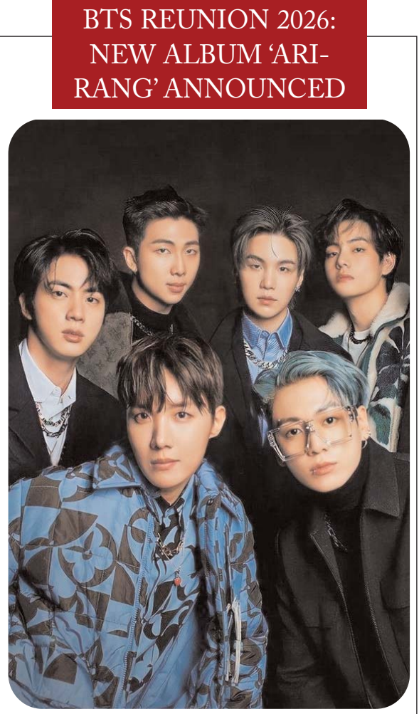
BTS REUNION 2026: NEW ALBUM 'ARI-RANG' ANNOUNCED