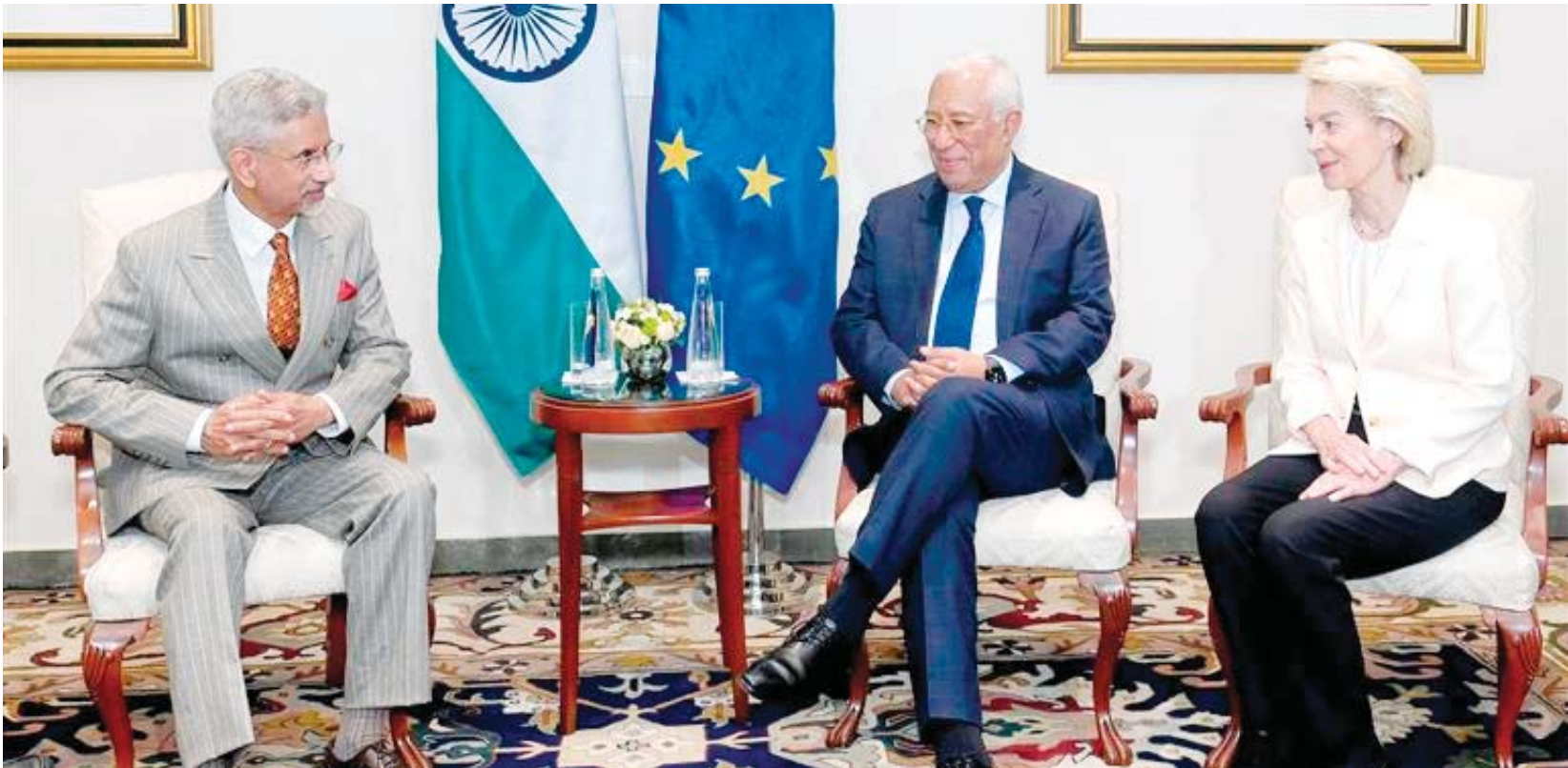
The President of the European Council Mr. Antonio Costa and the President of the European Commission Ms. Ursula von der Leyen met the Union Minister of External Affairs Dr. Subrahmanyam met Jaishankar.