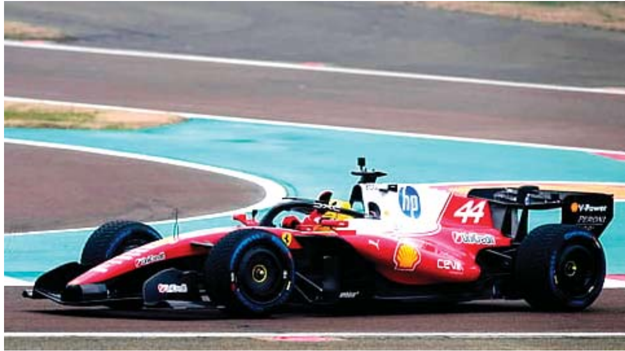
Britain’s Lewis Hamilton waves to fans as he steers his Ferrari Formula One SF-26 at the Ferrari private test track, in Fiorano Modenese, Italy, Friday.....

While Army celebrated ice-hockey glory, Haryana emerged as the overall champions of the Ladakh phase of KIWG 2026, driven by four gold medals from their figure skating and ice-skating contingent. Hosts Ladakh finished a commendable second overall, edging Maharashtra and Telangana on the basis of silver medals won.