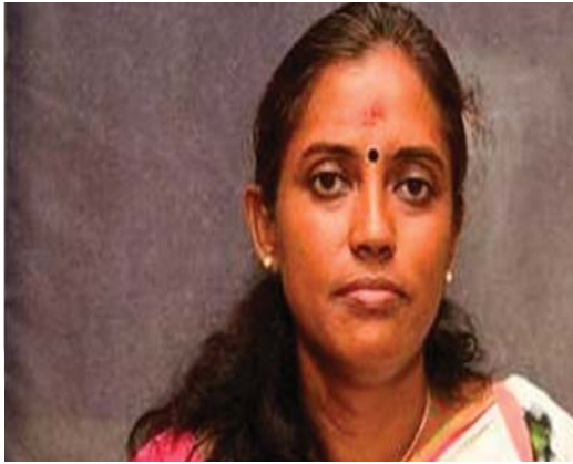
Congress MP Jothimani, in a strongly worded post on social media, on Friday flagged what she described as disturbing developments within the Tamil Nadu Congress, stating that no political party would normally obstruct its own Member of Parliament from submitting a booth agent list to the Election Commission during elections.

Calling the situation unprecedented, Jothimani said the issues unfolding in the Tamil Nadu Congress were deeply worrying. She alleged that attempts were being made to dilute the party's ideological positions and political activities, leading to growing disappointment among cadres. According to her,