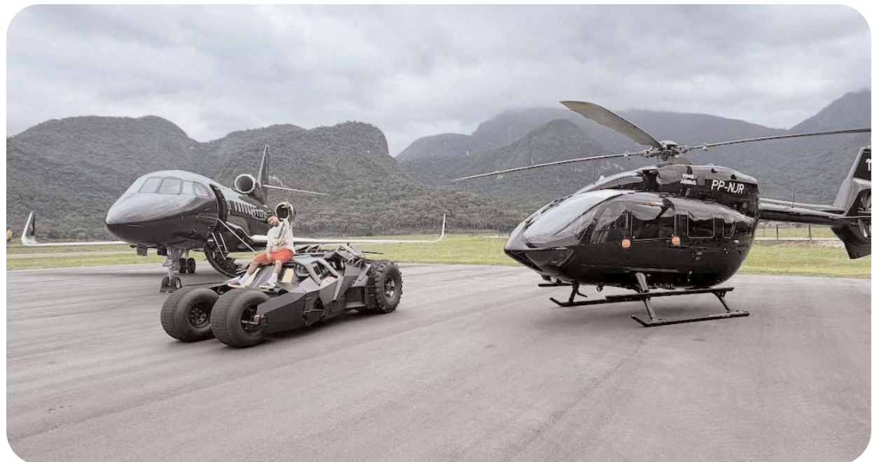
Neymar Flaunts Rs 525 Crore Luxury Fleet - A Batmobile Replica, Private Jet, Airbus Helicopter