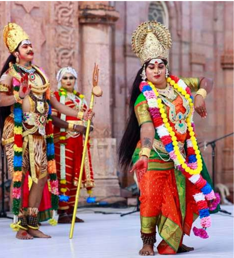
PHOTOGRAPHS OF CHENNAI SANGAMAM - NAMMA OORU THIRUVIZHA - SET I

the sentiments of Congress workers who are fighting to protect our movement Tagore also noted that he would express the feelings of Tamil Nadu Congress cadres to the All India Congress leadership and Leader of the Opposition Rahul Gandhi. He emphasised the need to safeguard the party's rights within the alliance. "We should not give up our rights again. We need to defeat the forces of religious extremism and respect the emotions of our party workers. Let us stand together in friendship and raise our voice for our rights," he added. Earlier, Tagore had stated that the Congress party was not seeking major ministries such as Public Works, Highways, Mines, or Urban Development in the event of a power-sharing arrangement.