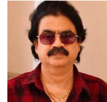
By Dr. Jithender Rao Thanugula Senior Journalist

Under the AMRUT 2.0 plan, four new overhead water tanks, each with a capacity of five lakh litres, will be constructed in different parts of the town to address the rising demand for drinking water. The locations include Islampur Colony, Little Scholar School area, Green City Colony, and Drivers Colony. Alongside these works, Shabbir Ali also inaugurated cement concrete road construction projects in Vikas Nagar and Lingapur wards, aimed at improving civic amenities in the region. The launch programme witnessed enthusiastic participation from local public representatives, municipal officials, and residents of Kamareddy.