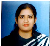
BY PVS SAILAJA

We, the people, bear a constitutional and moral duty to future generations; our present conduct forms the precedent upon which their history shall stand. "The Constitution of India is far more than a legal document defining powers and limitations of the State. It is a dynamic moral and legal charter that binds both the State and its citizens in a shared democratic responsibility. While the Constitution guarantees a wide spectrum of fundamental rights, it simultaneously expects citizens to uphold civic values and responsibilities that sustain constitutional democracy. Rights and responsibilities are not parallel ideas but interdependent pillars, without which democratic governance cannot endure. The Preamble of the Constitution, declared by the Supreme Court in S.R. Bommai v. Union of India (1994) as part of the basic structure, serves as the guiding compass of civic conduct. It enshrines justice, liberty, equality, and fraternity as foundational ideals of the Republic. These principles do not merely bestow entitlements;