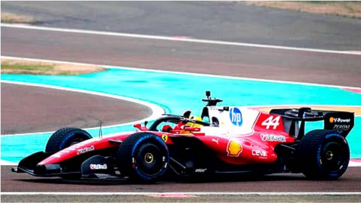
Britain’s Lewis Hamilton waves to fans as he steers his Ferrari Formula One SF-26 at the Ferrari private test track, in Fiorano Modenese, Italy, Friday.....

matic end to the Ladakh leg of the Games. While Army celebrated ice-hockey glory, Haryana emerged as the overall champions of the Ladakh phase of KIWG 2026, driven by four gold medals from their figure skating and ice-skating contingent. Hosts Ladakh finished a commendable second overall, edging Maharashtra and Telangana on the basis of silver medals won.