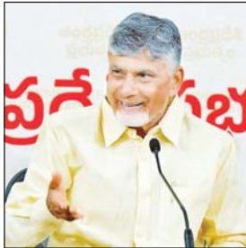
CM N.Chandrababu Naidu

On social media 'X' on Saturday, Chief Minister N Chandrababu Naidu tagged a Bank of Baroda report which says Andhra Pradesh has firmly established itself as India's leading investment destination, capturing a remarkable 25.3% of all proposed