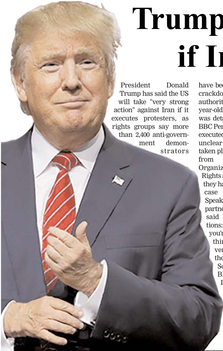
President Donald Trump has said the US will take "very strong action" against Iran if it executes protesters, as rights groups say more than 2,400 anti-government demonstrators