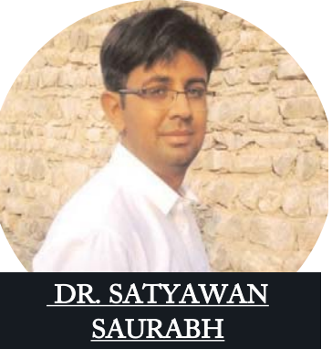
(Selection in the name of merit or killing of merit in the name of selection?)

on board. For the sponsors, the WPL ecosystem has expanded. They are starting to feel more and more confident in the overall, long-term vision of the BCCI - that the WPL can well and truly do for the women's game in India what the IPL did for the men's. Women's cricket in India and by extension the WPL are now very much a part of the economics of cricket conversation. And no one wants to miss the bus. Thankfully, while the women are finally enjoying a piece of the pie that was so far almost exclusively reserved for the men, no one is grudging them their success. We see it happen all the time in the men's game, with fans pointing out just how much money the star male cricketers are making, especially when they fail. The logic behind spending sums often equivalent to the price of a sprawling four-bedroom house in an ultra-luxury locality in Gurgaon or even Mumbai on acquiring the services of one player for one season at an IPL player auction is often questioned. While the female cricketers are not paid anywhere in the same vicinity as their male counterparts, just yet (Smriti Mandhana, Nat Sciver-Burnt and Ashleigh Gardner were retained for a record Rs 3.5 crore by their franchises, while in the IPL, Virat Kohli was retained by RCB for Rs 21 crore ahead of the 2025 mega auction), we must also not forget that the WPL is only four years old so far.