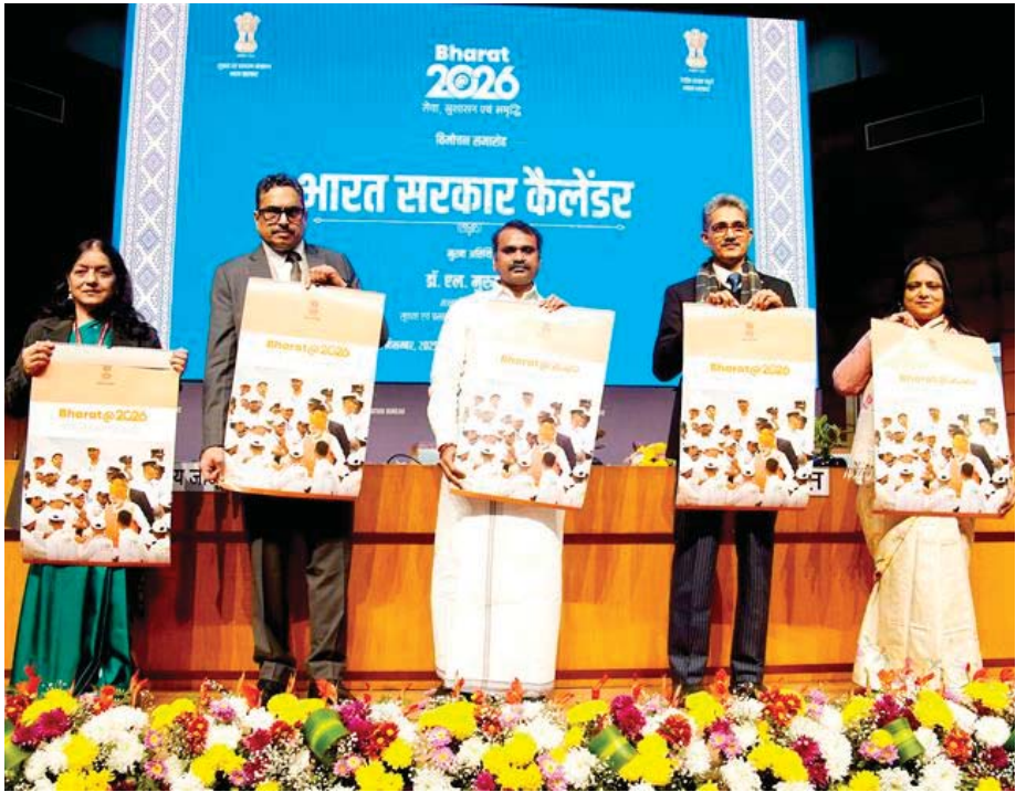
Union Minister of State for Information and Broadcasting and Parliamentary Affairs Dr. L. Murugan launching the Government of India’s Calendar 2026 on the theme “Bharat@2026: Seva, Sushasan aur Samridhi” at the National Media Center in New Delhi ....

India, said restaurants were in touch with delivery platforms and were awaiting clarity. He noted that the December 25 strike had significantly impacted businesses, especially in Gurgaon. At the same time, several delivery partners said they could not afford to join the strike due to fear of income loss or termination of their IDs. Many said that after expenses such as fuel, food and rent, daily earnings leave them with very little to support their families. An internal communication to Zomato riders reportedly stated that no partner would be stopped from making deliveries and that alternative arrangements had been made. Even so, some customers and restaurants pre-emptively placed bulk orders or arranged self-delivery, anticipating disruptions. With New Year’s Eve being one of the busiest days for food delivery, industry stakeholders said any prolonged disruption could lead to significant losses, even as workers insisted the strike was necessary to highlight safety and livelihood concerns.