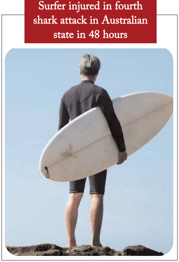
Surfer injured in fourth shark attack in Australian state in 48 hours

connection to that other world religion - football. On the day we visit, a group of Palestinian children are lining up to take penalty shots in the winter sunshine. The construction of the pitch began here on the edge of Bethlehem in 2020, and today it provides a place to practise for more than 200 young players from the nearby Aida refugee camp. The cramped and crowded streets contain the homes of the descendants of Palestinian families who were forced or who fled from their homes during the 1948 Arab-Israeli war. On 3 November last year, as the children made their short walk from the camp for that day's training, they found a notice pinned to the gate of the football field declaring it to be illegal. The notice was followed soon by a demolition order. "We don't have anywhere else to play," 10-year-old Naya told me, wearing a Brazil shirt with the name of the footballing legend Neymar emblazoned on the back.