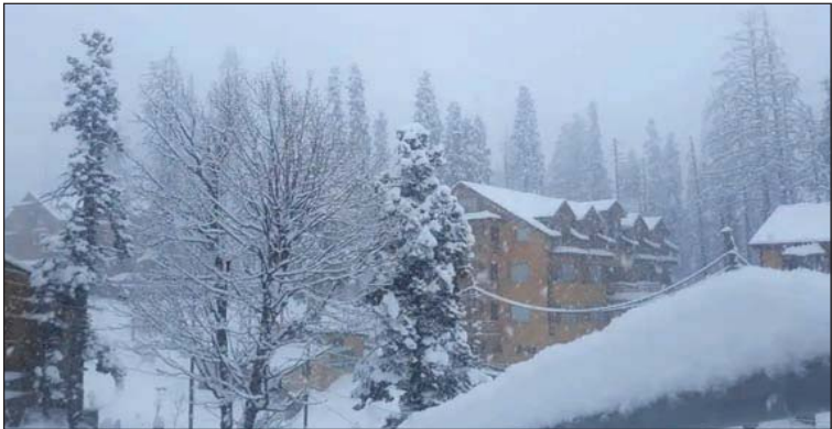
also remained closed. the Srinagar-Leh Highway and the Mughal Road yesterday and till

Srinagar, Jan 24 (IANS) Significant snowfall and rainfall occurred in Jammu and Kashmir (J&K) during the last 24 hours. Air and surface transport remained disrupted throughout the day on Friday and the Border Roads Organisation (BRO) said on Saturday morning that its men and machinery were working to remove the accumulated snow and ice to make the Srinagar International Airport operational today. No flight operation could take place from the airport yesterday as the Srinagar-Jammu Highway