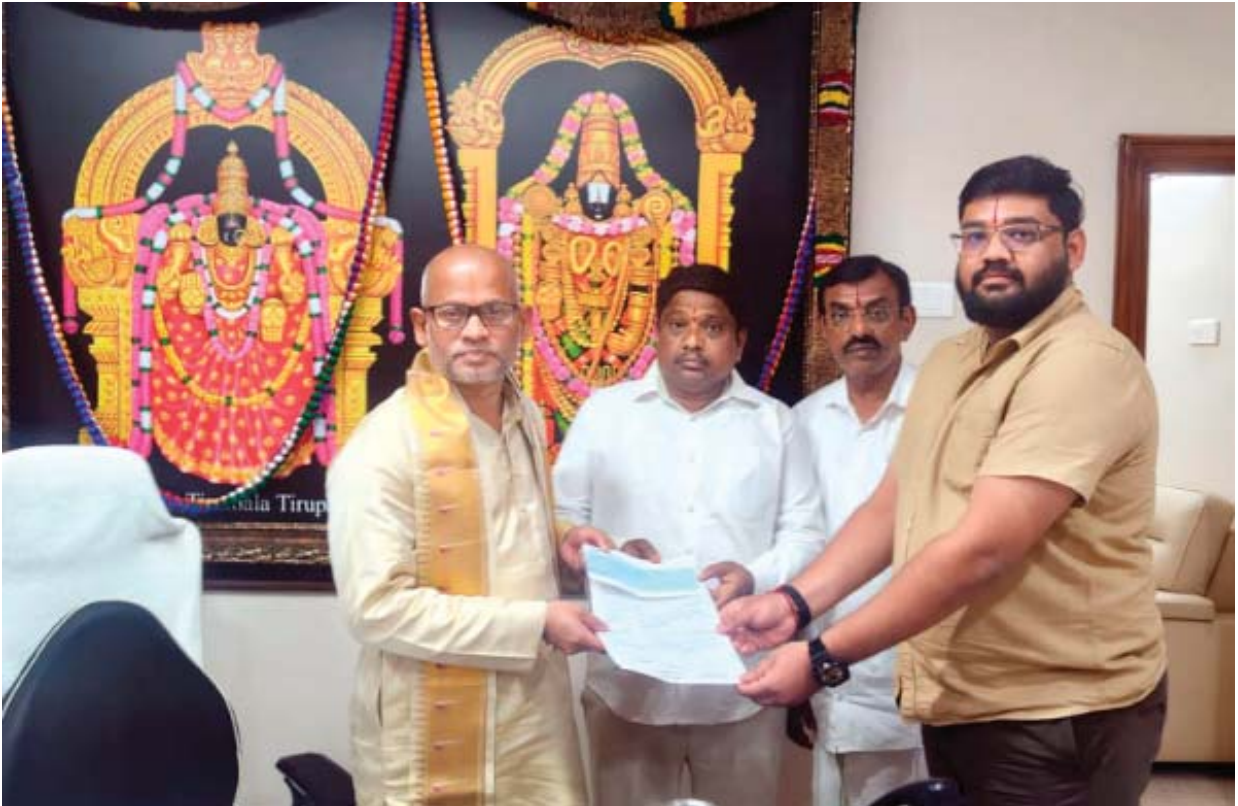
DONATION OF RS 10 LAKHS TO TTD VIDYADANA TRUST

be ready to discuss any inter-state issue only if Andhra Pradesh stopped the Rayalaseema project, which was taking away three TMC of water every day. The Telangana Chief Minister also offered to send a fact-finding committee comprising leaders of all parties, including opposition Bharat Rashtra Samithi (BRS), to verify if the project has stopped or not. However, while rejecting the Telangana CM's claim, the Andhra Pradesh government stated the project's suspension had nothing to do with the present government's decisions or political considerations. The state government pointed out that during the tenure of former Chief Minister Y. S. Jagan Mohan Reddy, the Rayalaseema Lift Project was taken up without obtaining mandatory statutory approvals.