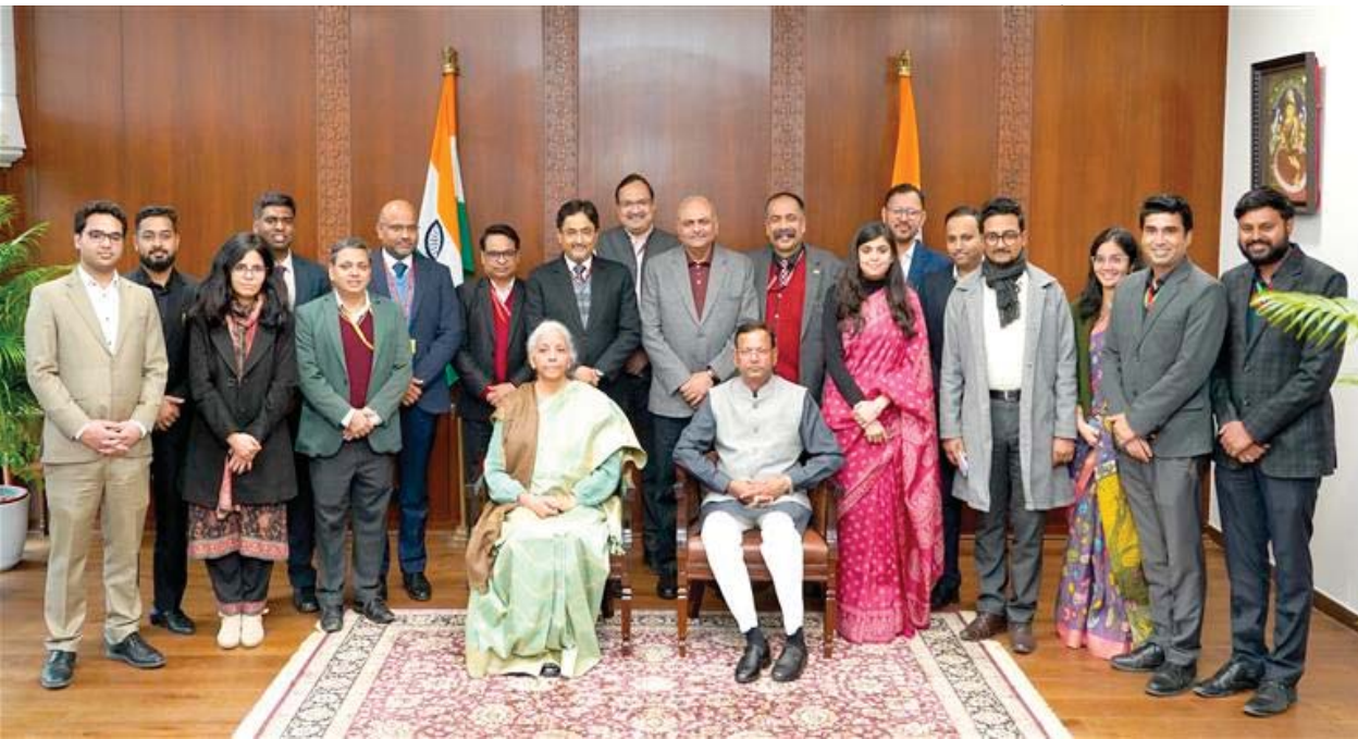
Union Minister of Finance and Corporate Affairs Smt. Nirmala Sitharaman along with Minister of State for Finance Shri Pankaj Choudhary and the entire budget team are present after the finalization of the Union Budget 2026 in New Delhi on January 31, 2026.

Ramesh said on X, in an apparent reference to BJP MP Abhijit Gangopadhyay's controversial remarks in 2024. Ramesh also shared a link to Nehru's address on All India Radio on the night of January 30, 1948, after Mahatma Gandhi's assassination. In his letter to Mookerjee, Nehru had said the Hindu Mahasabha had held meetings in Pune, Ahmednagar and Delhi in defiance of the ban order. "Speeches were delivered that Mahatma Gandhi was an impediment, and the sooner he died, the better it would be for the country. The RSS has behaved in an even worse way, and we have collected a mass of information about its very objectionable activities," Nehru had said in his letter. Ramesh also shared a screenshot of Patel's letter to Mookerjee in which the former criticised the activities of the RSS and the Hindu Mahasabha.