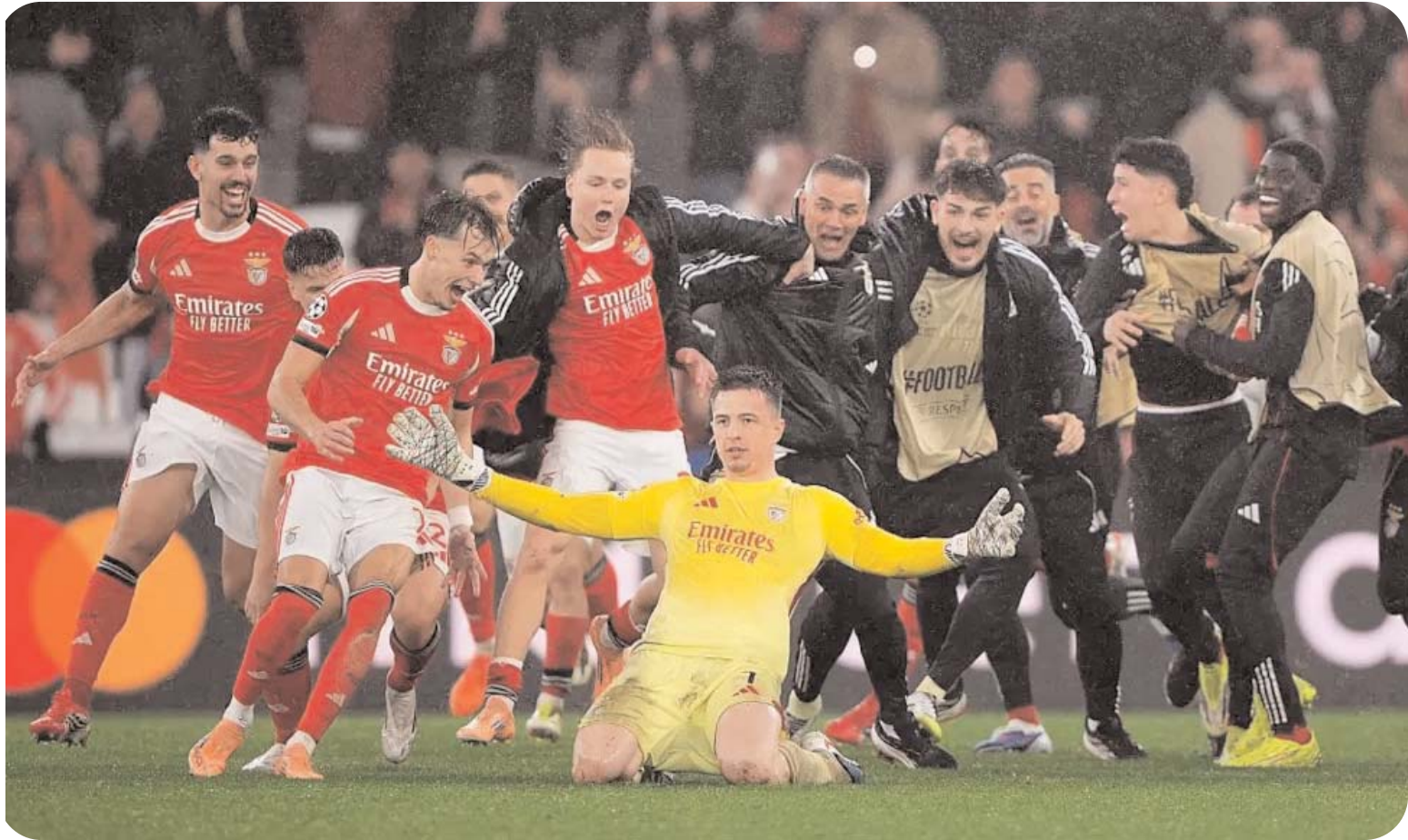
Benfica goalkeeper Anatoliy Trubin celebrates scoring his team's fourth goal with a header alongside teammates during the Champions League tie against Real Madrid at Estadio do SL Benfica in Lisbon, Portugal.