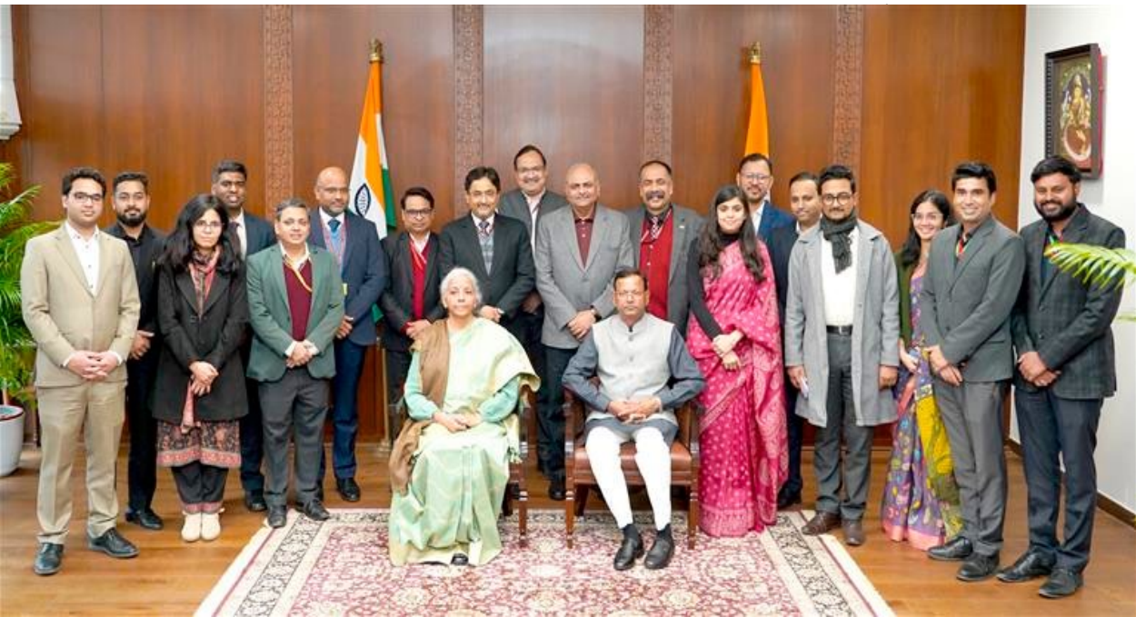
Union Minister of Finance and Corporate Affairs Smt. Nirmala Sitharaman along with Minister of State for Finance Shri Pankaj Choudhary and the entire budget team are present after the finalization of the Union Budget 2026 in New Delhi on January 31, 2026.

Ramesh said on X, in an apparent reference to BJP MP Abhijit Gangopadhyay's controversial remarks in 2024. Ramesh also shared a link to Nehru's address on All India Radio on the night of January 30, 1948, after Mahatma Gandhi's assassination. In his letter to Mookerjee, Nehru had said the Hindu Mahasabha had held meetings in Pune, Ahmednagar and Delhi in defiance of the ban order. "Speeches were delivered that Mahatma Gandhi was an impediment, and the sooner he died, the better it would be for the country. The RSS has behaved in an even worse way, and we have collected a mass of information about its very objectionable activities," Nehru had said in his letter. Ramesh also shared a screenshot of Patel's letter to Mookerjee in which the former criticised the activities of the RSS and the Hindu Mahasabha.