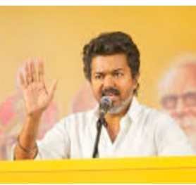
hinting at the unproven electoral or governance trackrecord of the fledgling party and its novice president.