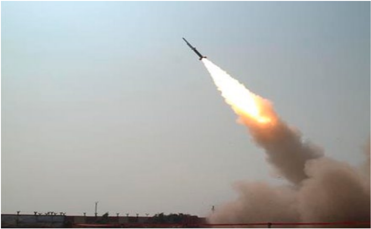
The Defense Research and Development Organization (DRDO) successfully demonstrated the Solid Fuel Ducted Ramjet (SFDR) technology on 3 February 2026 from the Integrated Test Range (ITR) at Chandipur, off the coast of Odisha.

Chief Minister. They expressed confidence that the global exposure and leadership insights gained through the Harvard programme would contribute to more effective and forward-looking governance in the State.