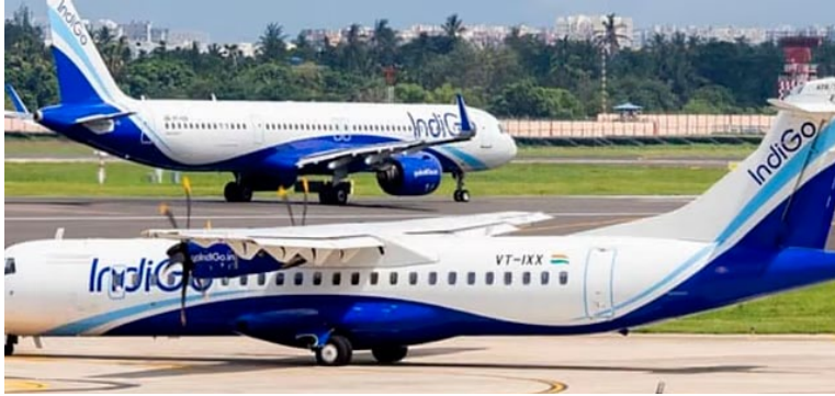
of daily flights. At present, the air-line operates eight flights from Chennai to Madurai and eight return services, totalling 16 flights

CHENNAI: Air connectivity from Chennai to Madurai and Tiruchy has been expanded, with airlines introducing additional services and re-deploying smaller ATR aircraft on key sectors. The increase in daily flight frequency has brought relief to passengers who had been facing seat shortages and limited timing options. Madurai sector sees major increase in frequency IndiGo has reinstated multiple ATR (smaller aircraft) services between Chennai and Madurai, significantly raising the number