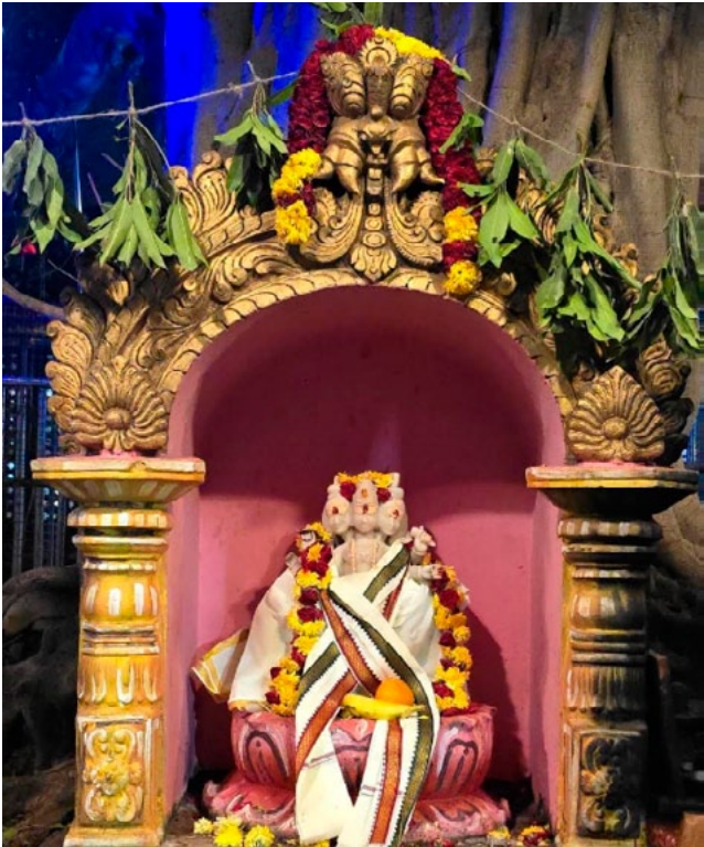
Srisaila Devasthanam, For the welfare of the world, the Devasthanam today (05.01.2026) performed special pujas to Sri Datatreya Swamy, who is situated under the Triphala tree in the temple premises.

oped into a Super Smart City and noted that over 2,000 crore had already been spent on the town's development. He said the upgradation to Municipal Corporation status had created new growth opportunities and assured that civic issues raised during the campaign would be resolved on priority after the polls. Komatireddy Venkat Reddy said he had never betrayed public trust and would continue to stand with the people. Seeking votes as a mark of gratitude, he stated that development works were being carried out in line with public needs and aspirations.