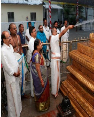
Tirupati :In view of the annual Brahmotsavams scheduled to be held from February 08 to 16, Koil Alwar Tirumanjanam was conducted in a grand manner on Thursday at Sri Kalyana Venkateswara Swamy Temple in Srinivasa Mangapuram. It is a traditional practice to perform Koil Alwar Tirumanjanam prior to the commencement of annual Brahmotsavams. The Koil Alwar Tirumanjanam was performed from 6.30 a.m. to 11 a.m. During the ritual, the temple premises including walls, ceilings, and all pooja articles were thoroughly cleansed with water and a sacred aromatic mixture "Parimalam", was sprinkled all over the temple. The devotees were allowed for darshan from 11a.m. onwards.