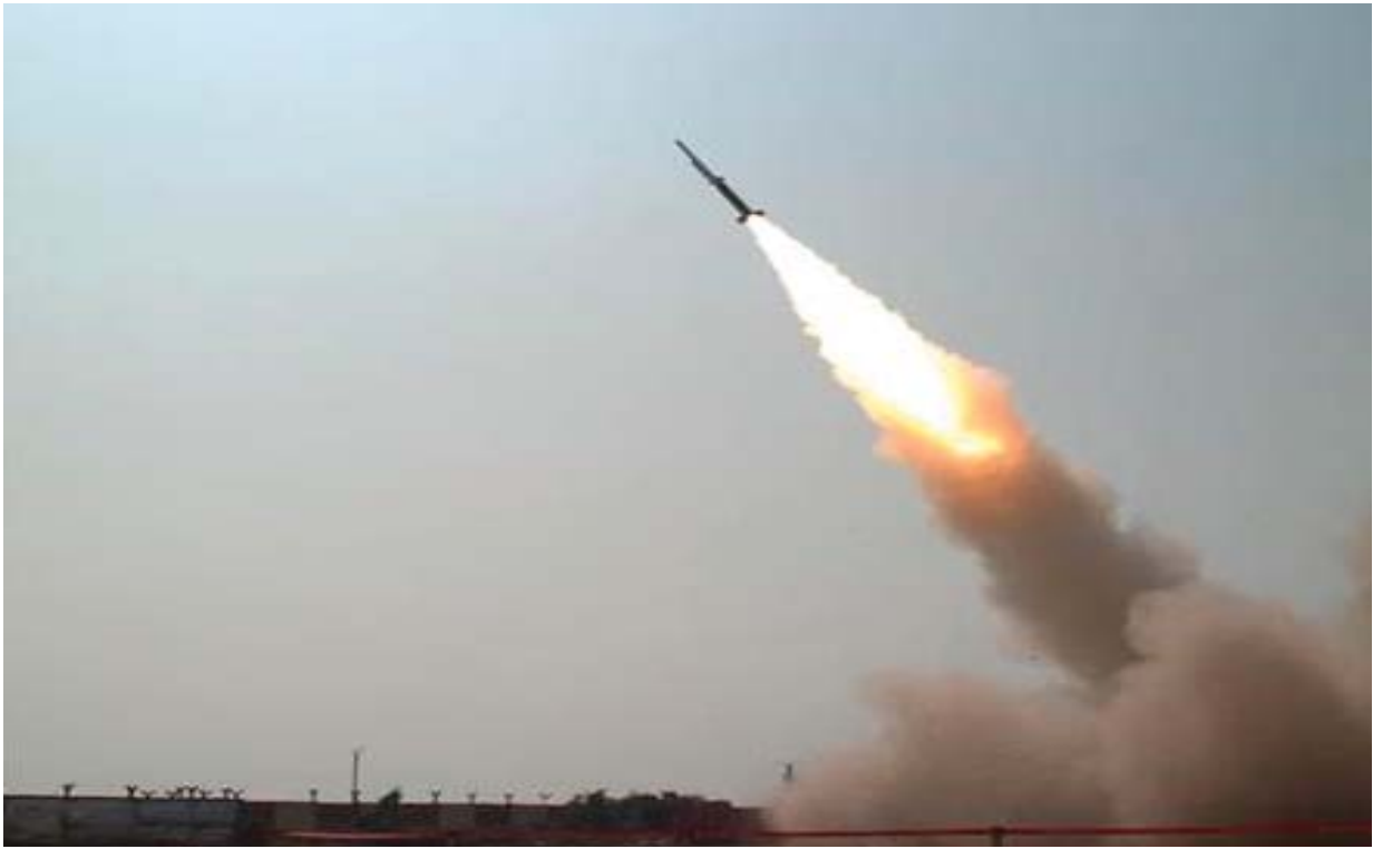
The Defense Research and Development Organization (DRDO) successfully demonstrated the Solid Fuel Ducted Ramjet (SFDR) technology on 3 February 2026 from the Integrated Test Range (ITR) at Chandipur, off the coast of Odisha.

Chief Minister. They expressed confidence that the global exposure and leadership insights gained through the Harvard programme would contribute to more effective and forward-looking governance in the State.