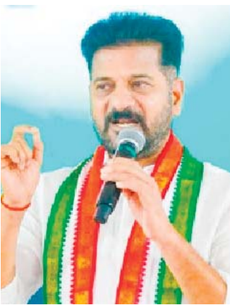
arrested KCR and Harish Rao for the alleged irregularities in the Kaleshwaram project and KTR for the Formula E

Hyderabad (TSIT): Alleging a secret understanding between BRS and BJP for the municipal elections, Telangana Chief Minister A. Revanth Reddy on Thursday alleged that the BJP is taking ‘protection money’ to shield BRS leaders in various scams. He challenged the BJP government at the Centre to arrest former Chief Minister K. Chandrasekhar Rao (KCR) and his son K. T. Rama Rao (KTR) in the Kaleshwaram and Formula E race cases, respectively.Addressing a public meeting as part of the Congress party’s campaign for municipal elections, the Chief Minister questioned the BJP leadership why it has not