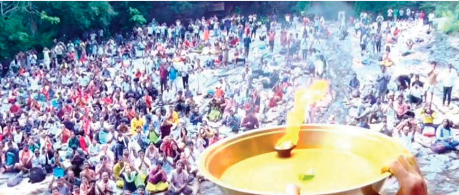
SRI RAMAKRISHNA TEERTHA MUKKOTI HELD WITH GRANDEUR...