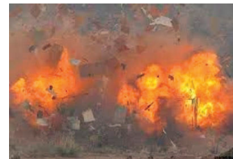
and other nearby hospitals to remain on alert to handle the emergency.

Earlier information had indicated that around 40 people were injured, with at least eight in critical condition. Ambulances rushed to the scene, and authorities instructed Thrissur Medical College