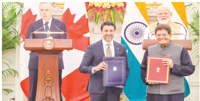
New Delhi (TSIT):

While trade negotiations between India and Canada have in the past been derailed due to political tensions between the two countries, the relaunch of talks during the visit of Canadian Prime Minister Mark Carney in March this year has provided a second chance to build a durable bilateral economic relationship amid the changed geopolitical landscape, according to India's former envoy to the North American country. "Canada faces its own structural dilemma. Its overwhelming economic dependence on the United States has become a strategic constraint, particularly in an era of geopolitical uncertainty. Diversification is no longer optional. In that context, India represents not just another market, but a long-term strategic partner," former High Commissioner to Canada, Sanjay Kumar Verma, highlighted in an