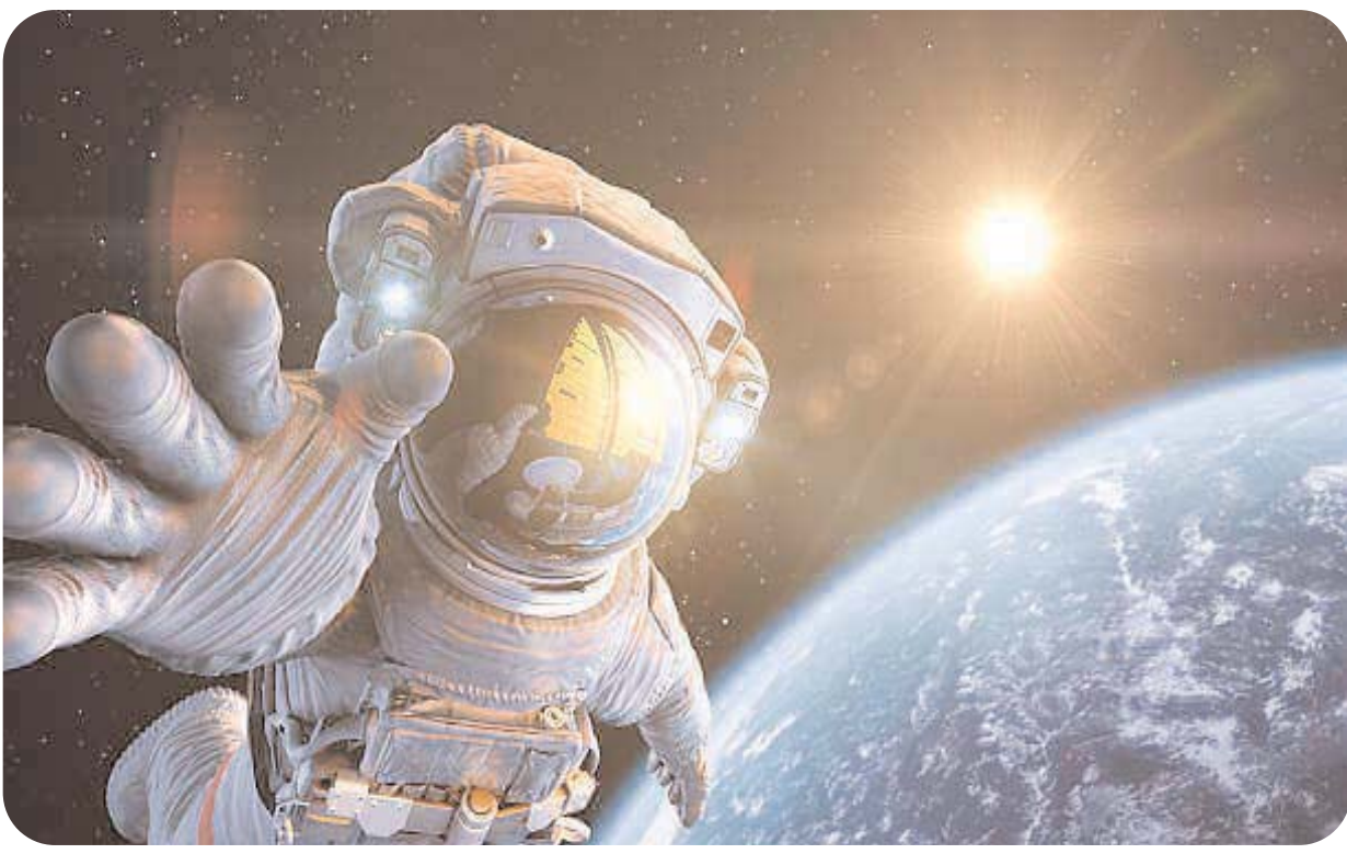
Astronauts in awe of Earth as they prepare for next phase of Moon mission