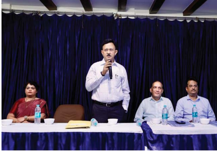
Junior Engineers (Mechanical), 2 Chemists, and 11 Chemical Supervisors. Verification of documents for the remaining posts is currently underway; once completed, appointment

During today's counselling, candidates selected for various posts were assigned their respective postings. These included 20 Assistant Engineers (Civil), 38 Assistant Engineers (Electrical), 20 Assistant Engineers (Mechanical), 27 Assistant Engineers (Instrumentation), 13 Junior Engineers (Civil), 61 Assistant Engineers (Electrical), 41