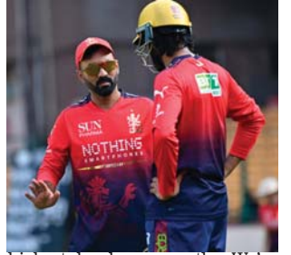
highest level so recently. We're very fortunate to have him," Phil Salt commented on the batting coach.

"DK is a mastermind. He's very detailed and excellent at gathering information along with Freddy (Wilde) and the rest of the coaching staff, and then simplifying it into something that's easy to take onto the pitch. That's probably his biggest strength. He brings a lot to the coaching setup, and it's even more valuable because he's played at the