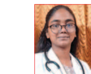
BY DYPA VIRTUSA