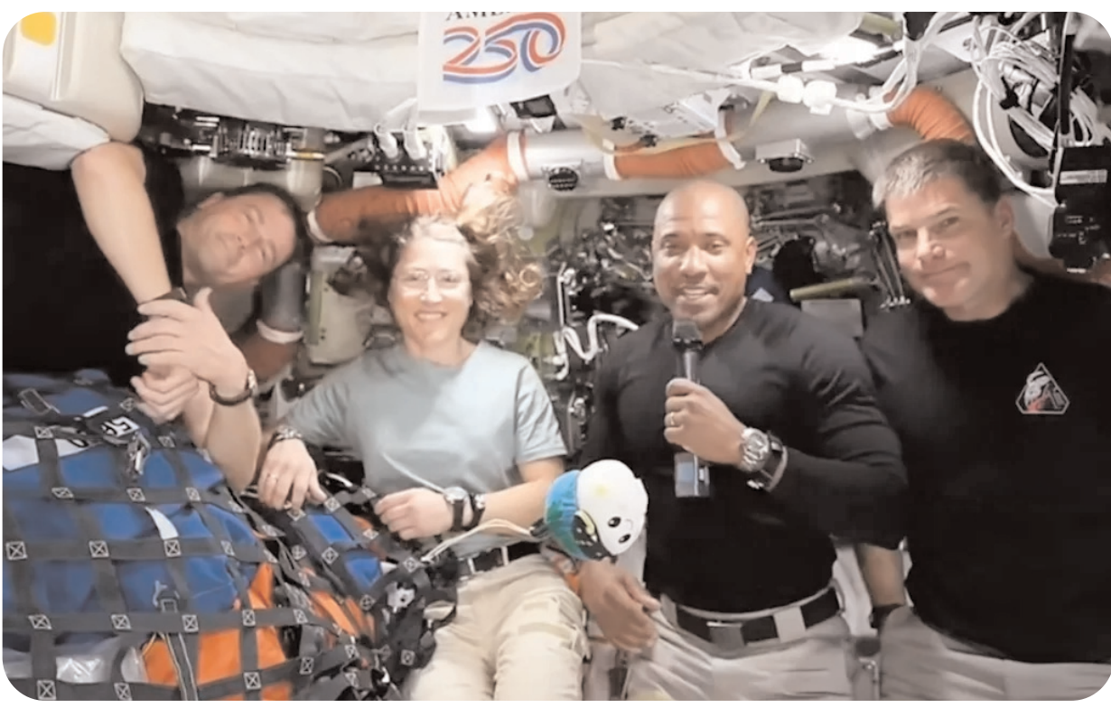
Artemis crew returning to Earth with 'all the good stuff' from Moon discoveries