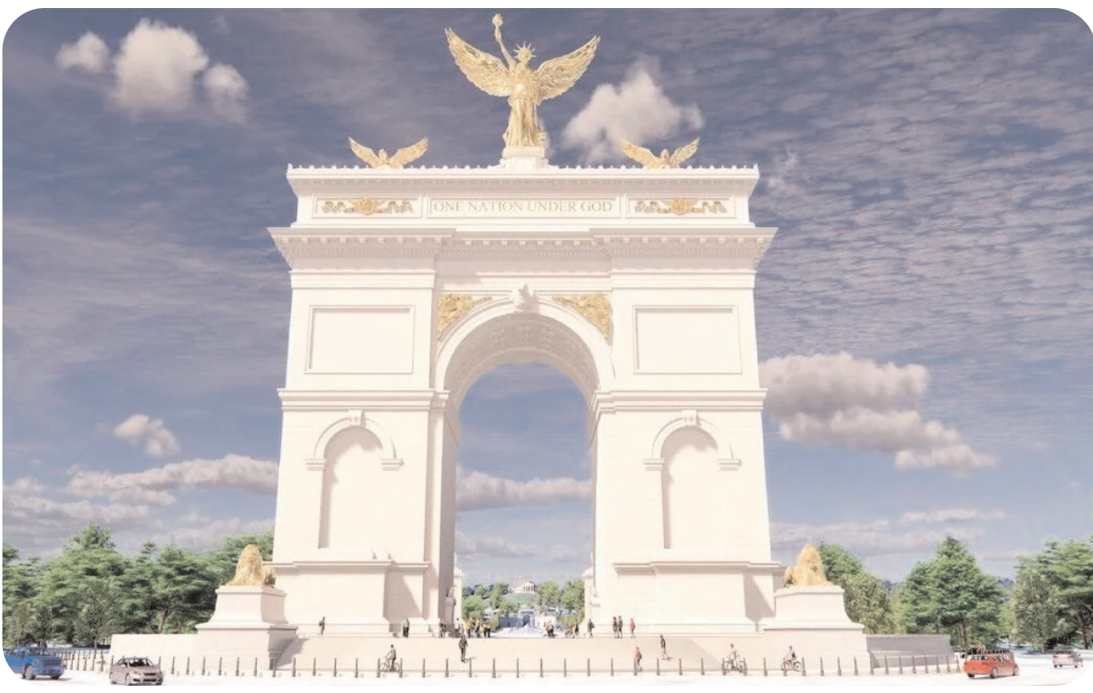
Trump administration unveils 250-foot 'Triumphal Arch' design