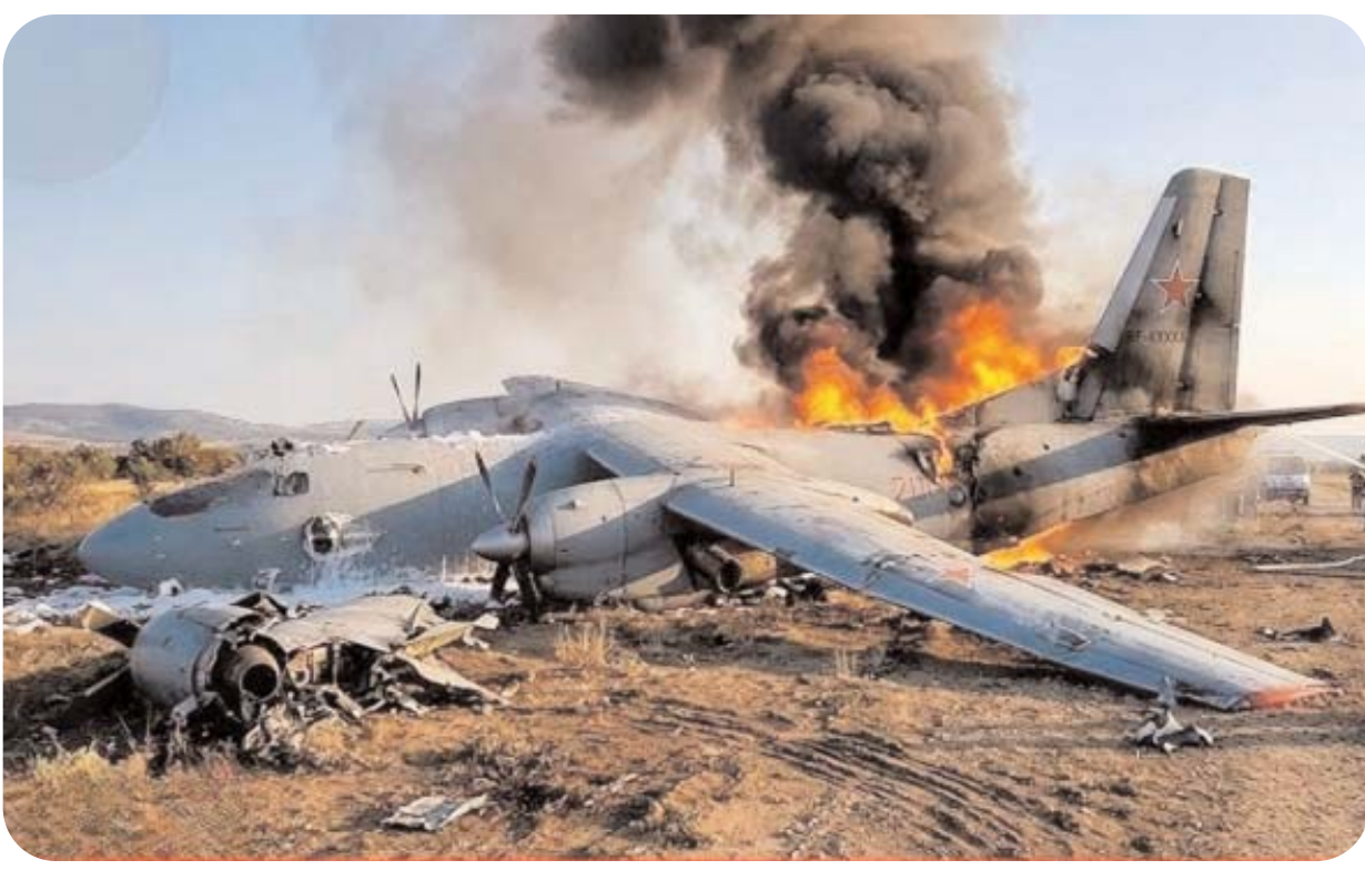
Russian military plane crash kills 29 in occupied Crimea

May, the Moulin Rouge website says. Ahead of her premiere, she expressed excitement for briefly substituting concerts with theatre performances. "HOTTIES IM ON BROADWAY!!!" she wrote on social media after her first performance on 24 March, referencing her fanbase, called the "hotties". Megan Thee Stallion is best-known for hits including Savage, WAP and Body. In 2021, she won three Grammy awards for Best Rap Song, Best New Artist and Best Rap Performance. The following year she was nominated for Album of the Year. Harold Zidler was first played by Danny Burstein in the original Broadway cast of Moulin Rouge, and won a coveted Tony award in 2020 for it. More recently, celebrity drag artist Bob the Drag Queen played Zidler in the musical for eight weeks earlier this year.