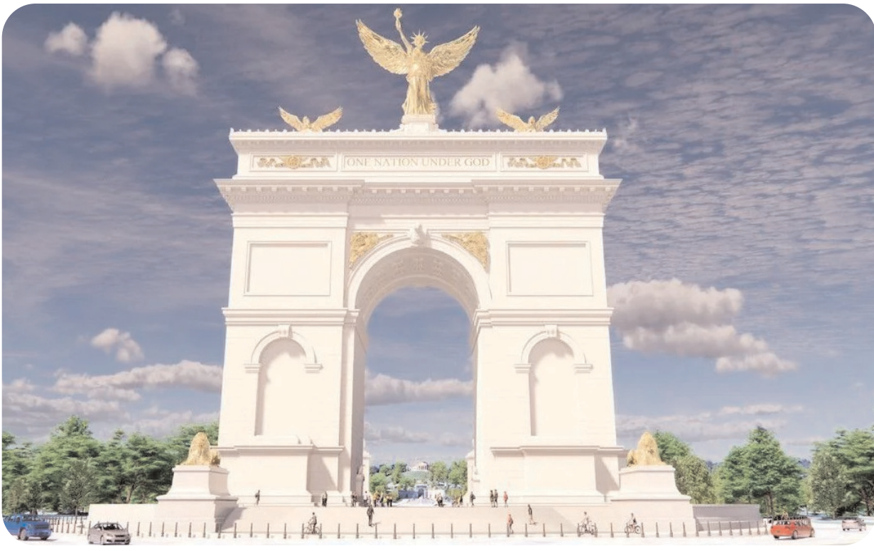
Trump administration unveils 250-foot 'Triumphal Arch' design