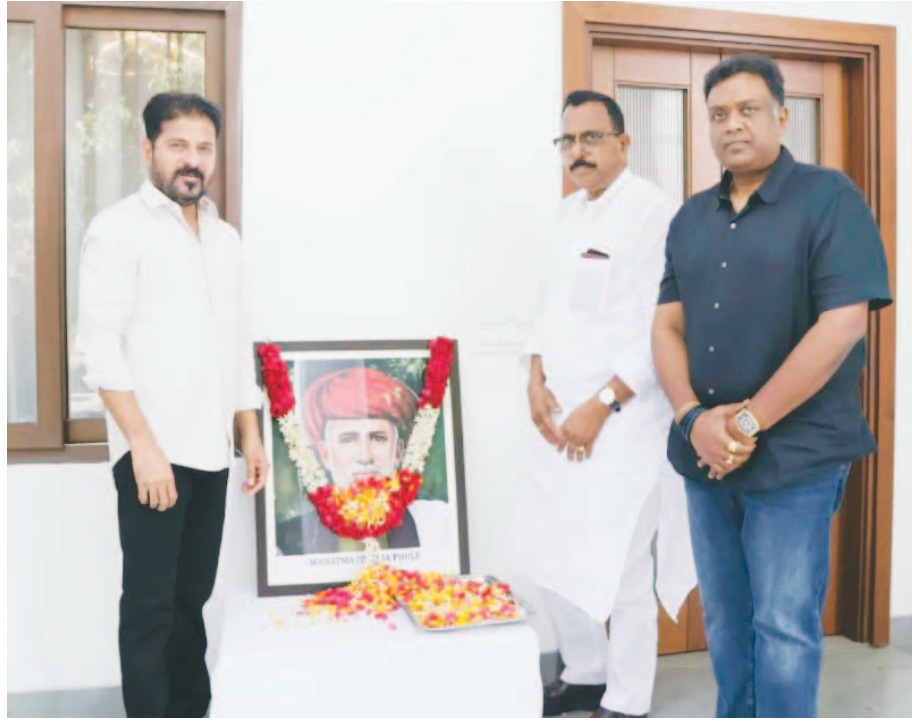
tion and social reforms. Leaders noted that the ideals and teachings of