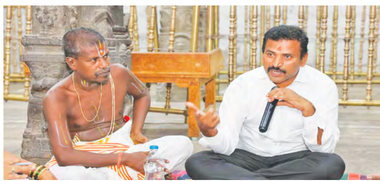
JEO TPT REVIEW WITH TTD OFFICIALS ON NAGALAPURAM BRAHMOTSAVAM ARRANGEMENTS AT NAGALAPURAM TODAY.