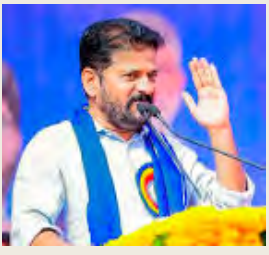
Hyderabad TSIT BUREAU.

Telangana Chief Minister A.Revanth Reddy described the defeat of the Women's Reservation Bill in the Lok Sabha as a "historic and unforgettable moment" in India's democratic journey.