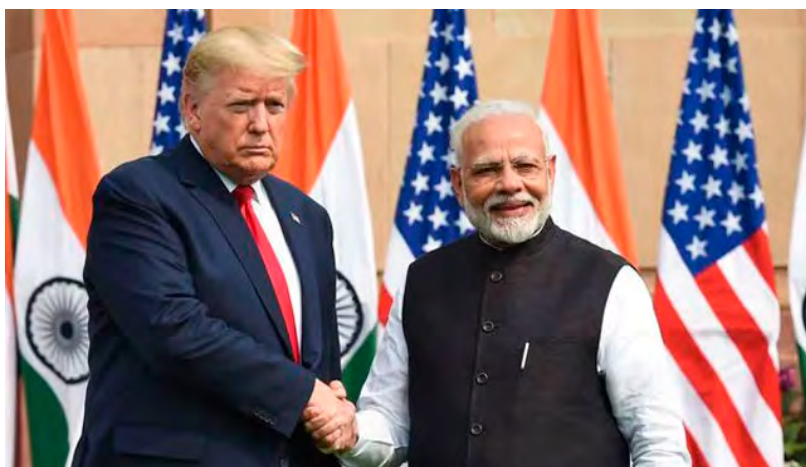
New Delhi, Apr 17: US President Donald Trump on Thursday described Prime Minister Narendra

Modi as a "friend" and said he had a "very good talk" with the Indian leader amid ongoing diplomatic