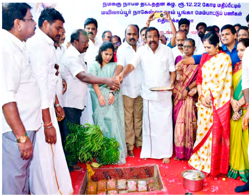
Honble Minister for Municipal Administration inaugurated development works at Nageswararao Park, Mylapore under the Namakku Naame scheme at an estimated cost of Rs.12.22 crores.

• 50% cut in cable TV subscription fee - The monthly charge for Government Cable TV services will be halved to ease household expenses.