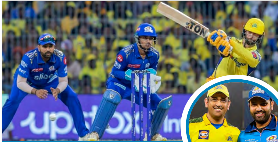
1st TIME IN IPL, NO MS DHONI AND ROHIT SHARMA IN MI VS CSK EL CLASICO

Mumbai: The wait to see MS Dhoni in IPL 2026 continues, as does the wait for Rohit Sharma's return from a hamstring injury. The star duo missed the Mumbai Indians vs Chennai Super Kings match. It was the first time that both players were absent from the 'El Clasico' since they became part of their respective teams. Earlier, decked out in their teams' training kits, Rohit Sharma and MS Dhoni batted in tandem during a nets session on Wednesday. The first leg of this year's IPL 'El Clasico' is being played at the Wankhede Stadium, but it remains to be seen whether the two main protagonists of the famed MI-CSK rivalry will be available for another bout. Rohit, who featured in the first four matches for MI, had walked off the field during the contest against Royal Challengers Bengaluru here 10 days ago with a hamstring injury and has since been on