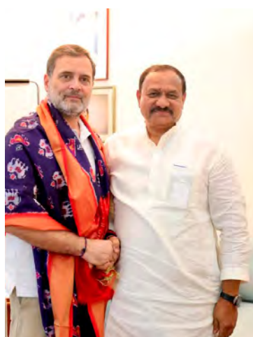
Gandhi to include provisions for Backward Class (BC) reservations in the proposed Women's Reservation Bill.