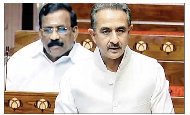
ernment of Aung San Suu Kyi.

The elections were held in December and January after years of protests against the ruling military-junta that seized power in a coup on February 1, 2021 overthrowing the democratically elected gov-