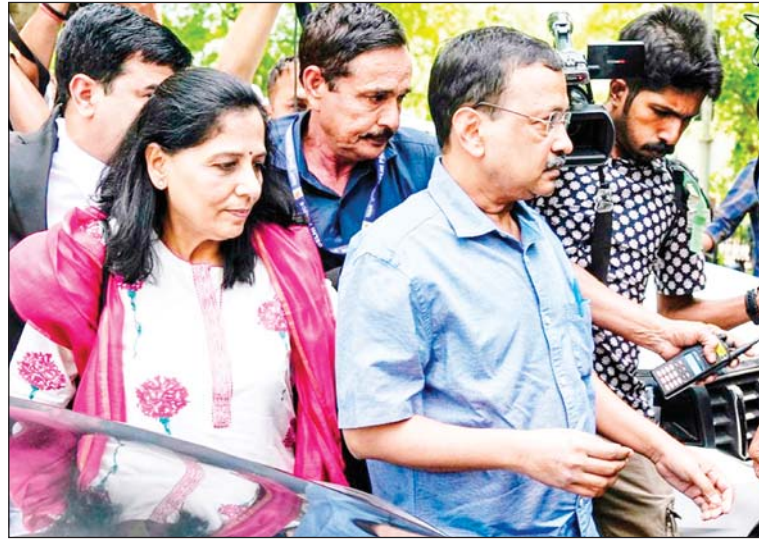
He also informed that a total of seven discharged accused have filed applications seeking the judge's recusal as part of a "well thought out design".