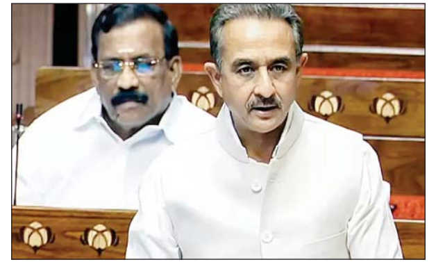
ernment of Aung San Suu Kyi.

The elections were held in December and January after years of protests against the ruling military-junta that seized power in a coup on February 1, 2021 overthrowing the democratically elected gov-