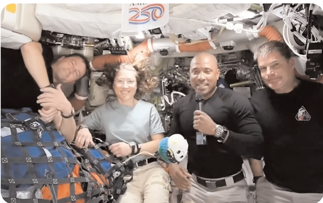
Artemis crew returning to Earth with 'all the good stuff' from Moon discoveries