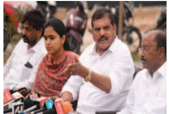
Chief Minister Y.S. Jagan Mohan Reddy (left) and Botsa Satyanarayana (right) during a press conference.