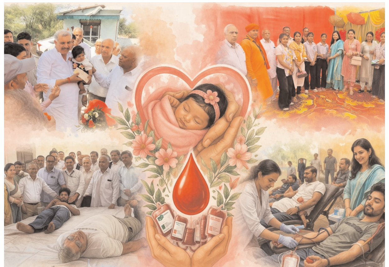
(A gamut of emotions filled with blood donation at the Government Girls Higher Secondary School, Barwa)